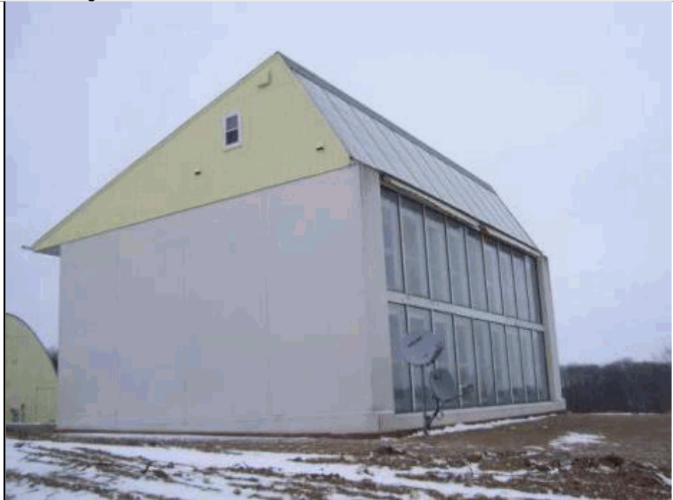
Total living area is 3,036 SF; building assessed value is $240,700