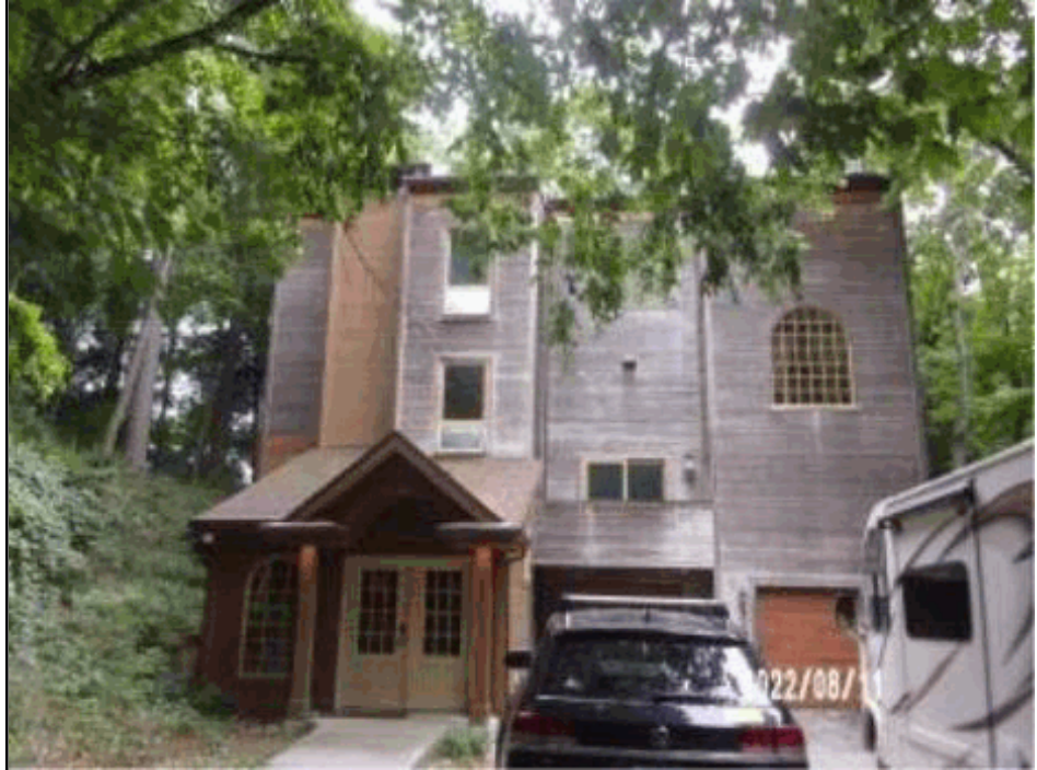
Total living area is 3,708 SF; building assessed value is $610,600