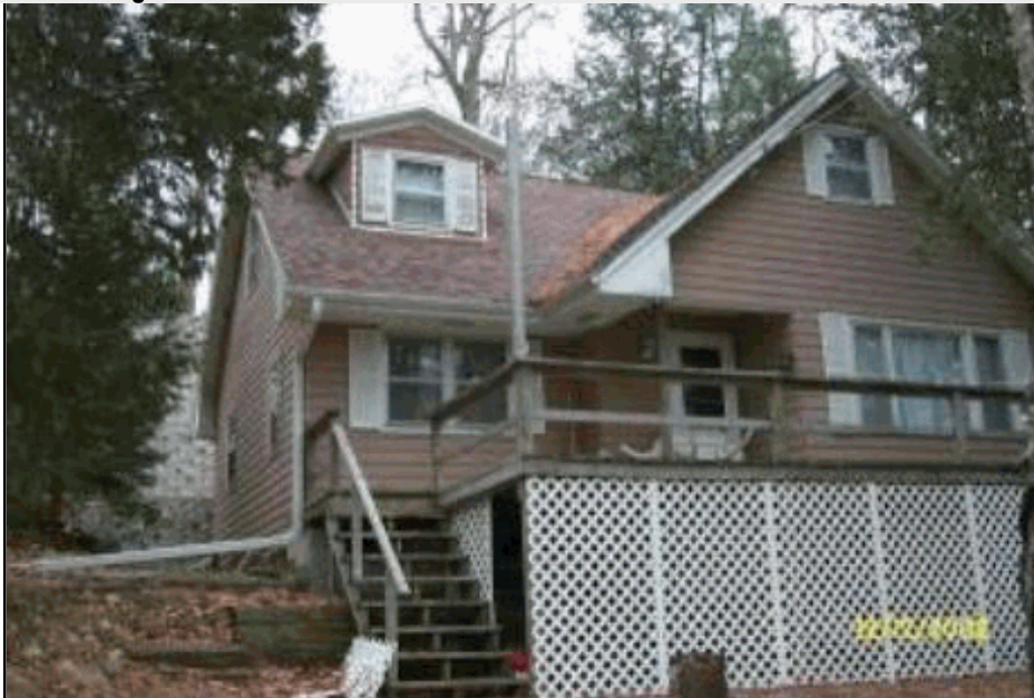
Total living area is 1,296 SF; building assessed value is $116,200