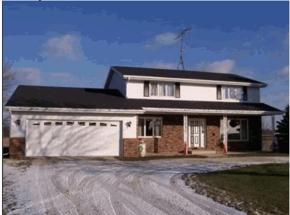
Total living area is 2,236 SF; building assessed value is $172,200