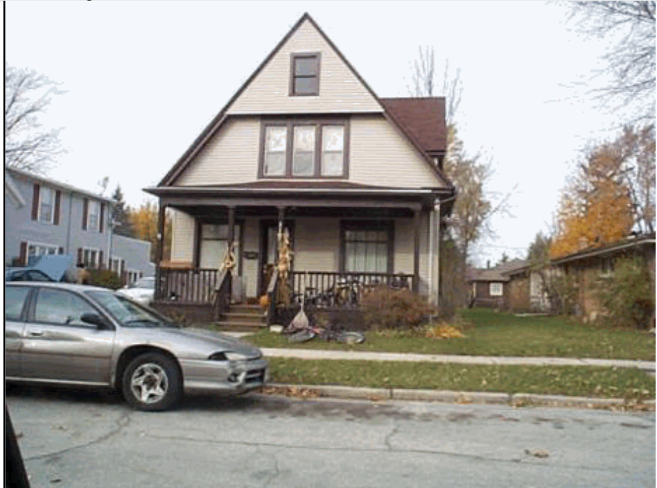
Total living area is 1,832 SF; building assessed value is $80,500