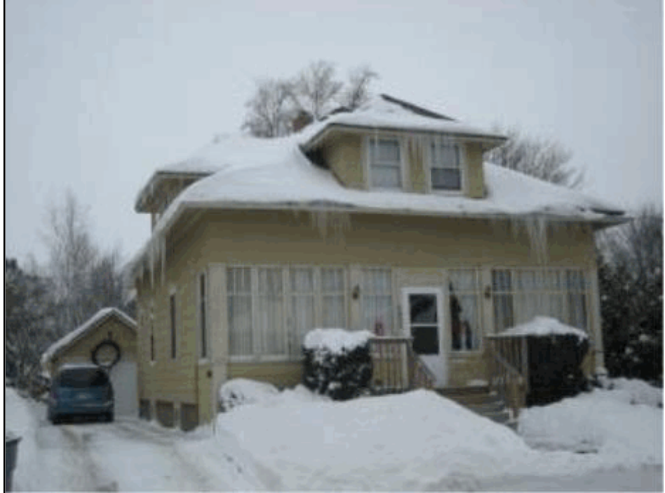
Total living area is 1,715 SF; building assessed value is $77,700