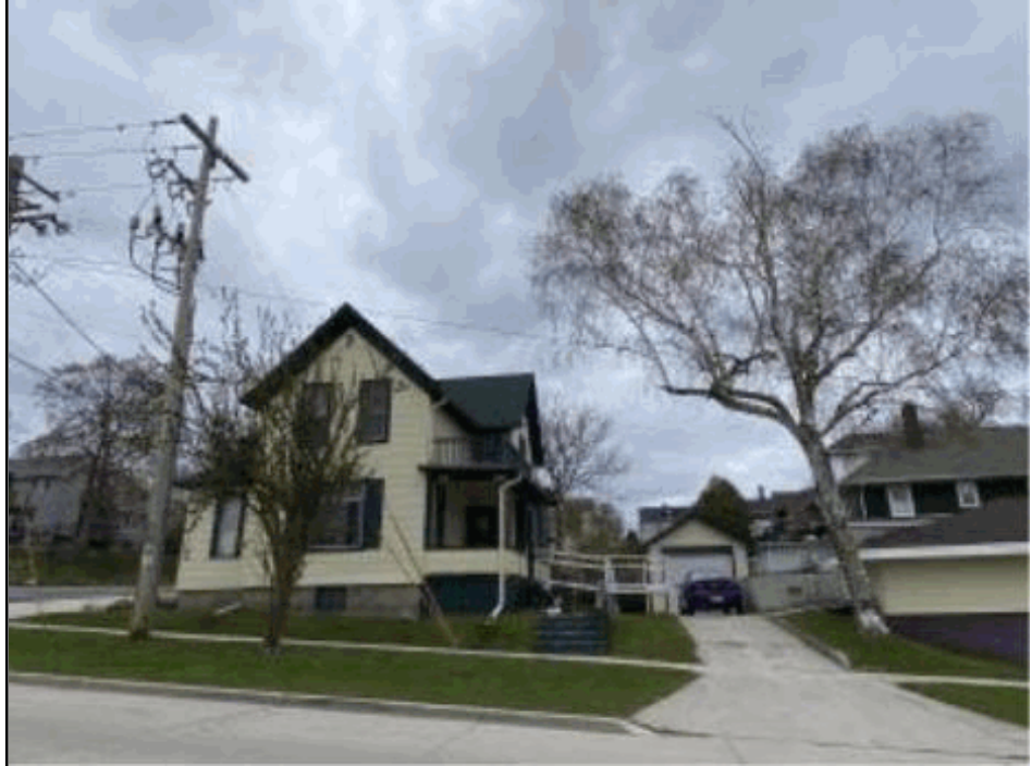
Total living area is 2,192 SF; building assessed value is $134,900