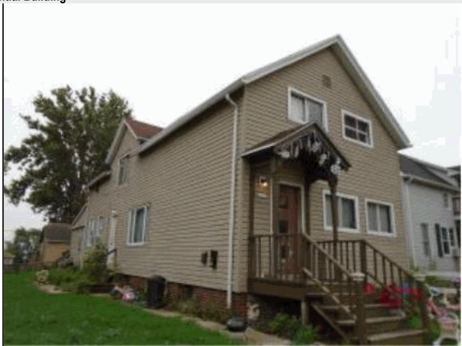
Total living area is 1,908 SF; building assessed value is $117,900