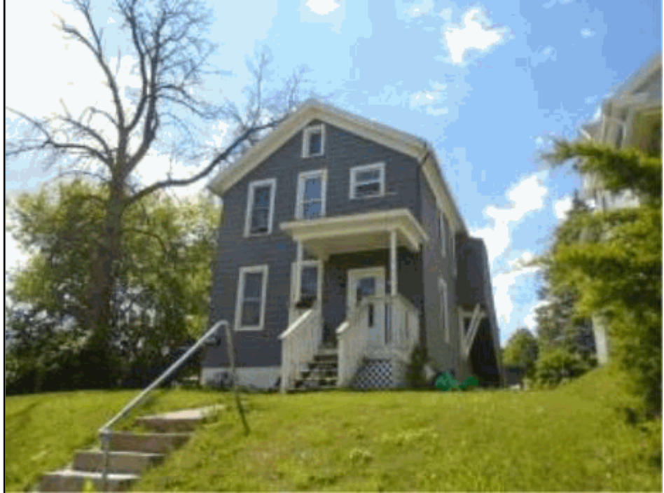
Total living area is 1,200 SF; building assessed value is $56,200