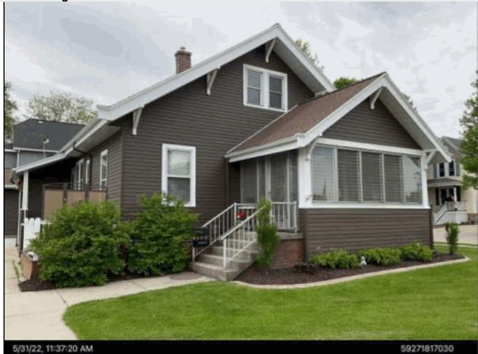
Total living area is 1,853 SF; building assessed value is $150,600