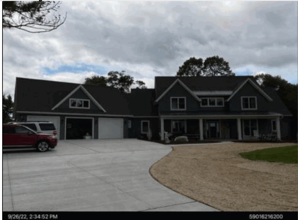
Total living area is 4,870 SF; building assessed value is $713,500