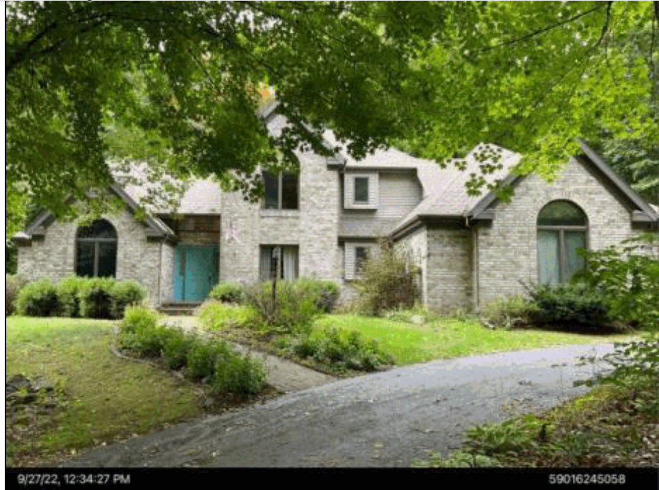
Total living area is 3,838 SF; building assessed value is $438,000