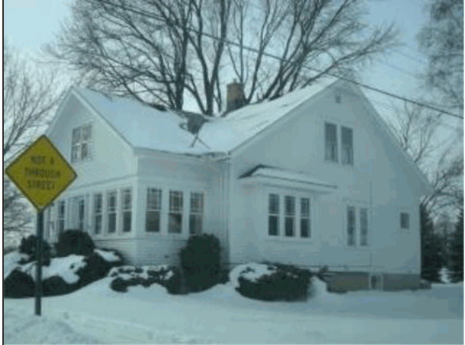
Total living area is 1,575 SF; building assessed value is $79,200