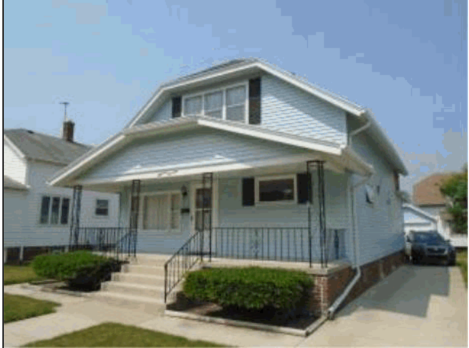
Total living area is 1,466 SF; building assessed value is $135,200