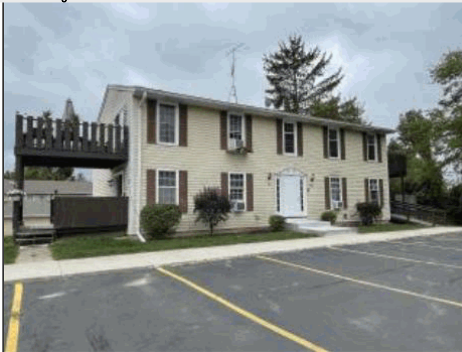
Total living area is 800 SF; building assessed value is $58,000