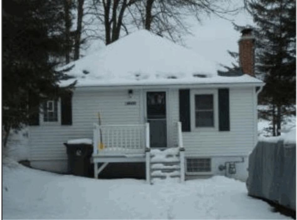
Total living area is 1,056 SF; building assessed value is $131,200