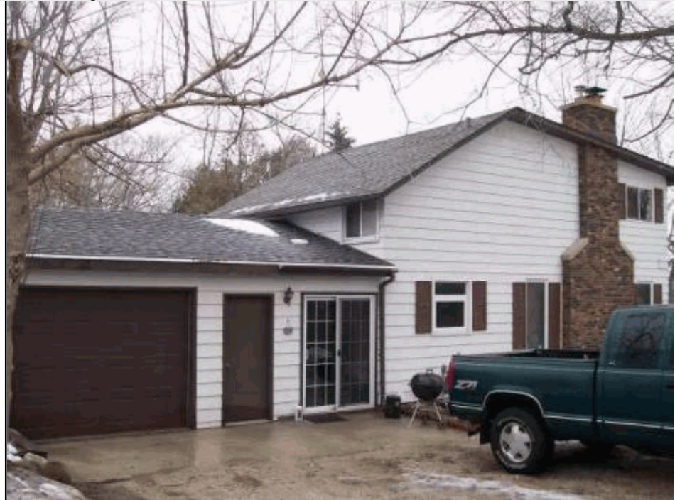
Total living area is 1,932 SF; building assessed value is $96,700