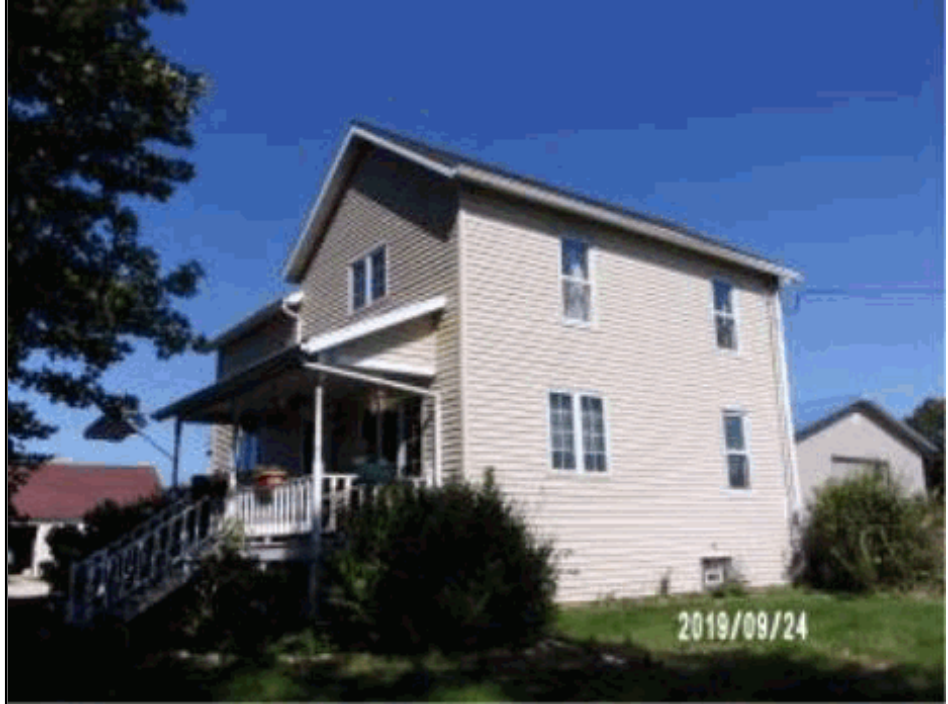
Total living area is 1,632 SF; building assessed value is $101,700