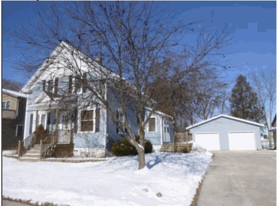
Total living area is 1,260 SF; building assessed value is $74,000