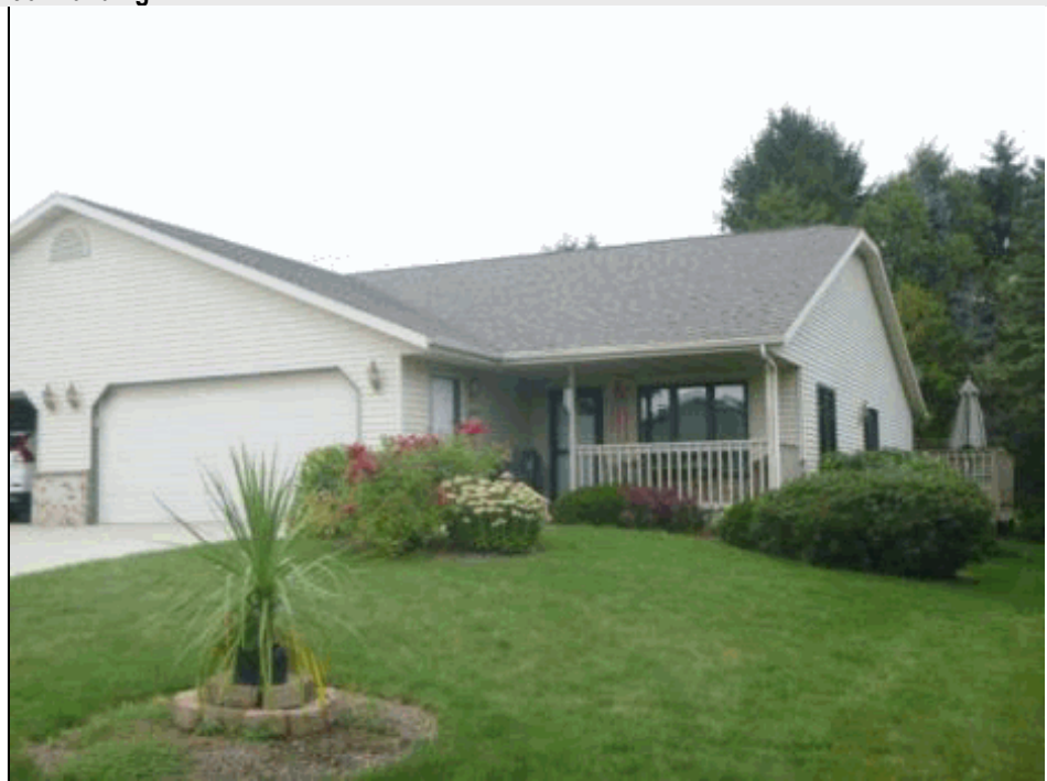
Total living area is 2,100 SF; building assessed value is $224,300