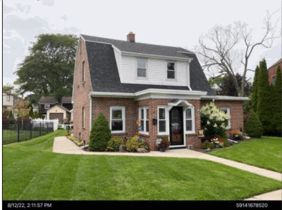
Total living area is 1,437 SF; building assessed value is $173,500