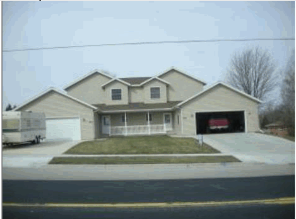
Total living area is 1,428 SF; building assessed value is $117,900