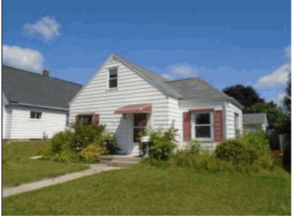
Total living area is 1,094 SF; building assessed value is $109,700