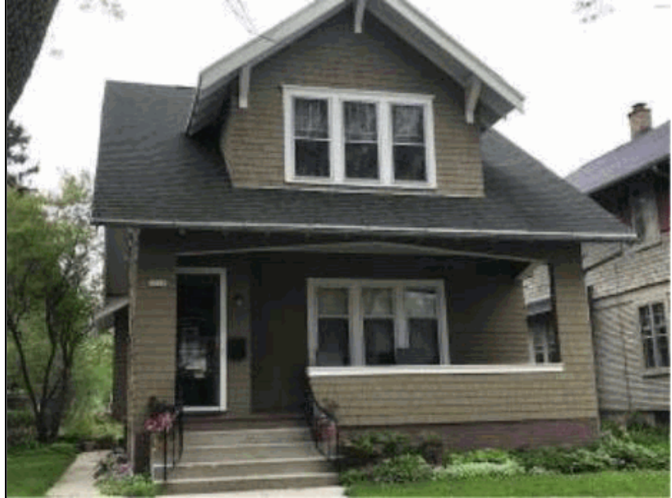
Total living area is 1,310 SF; building assessed value is $138,200