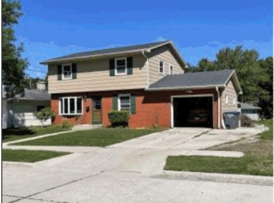
Total living area is 1,500 SF; building assessed value is $206,500