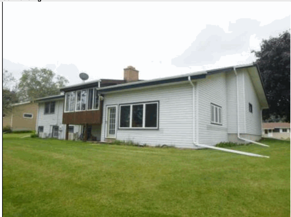
Total living area is 2,004 SF; building assessed value is $178,900