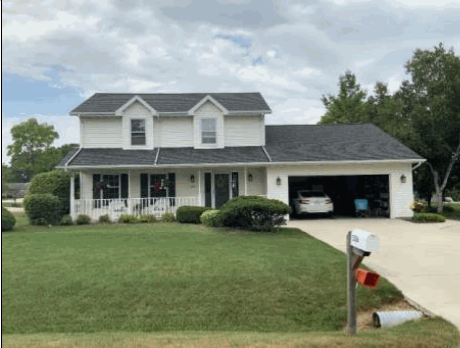
Total living area is 1,958 SF; building assessed value is $313,900