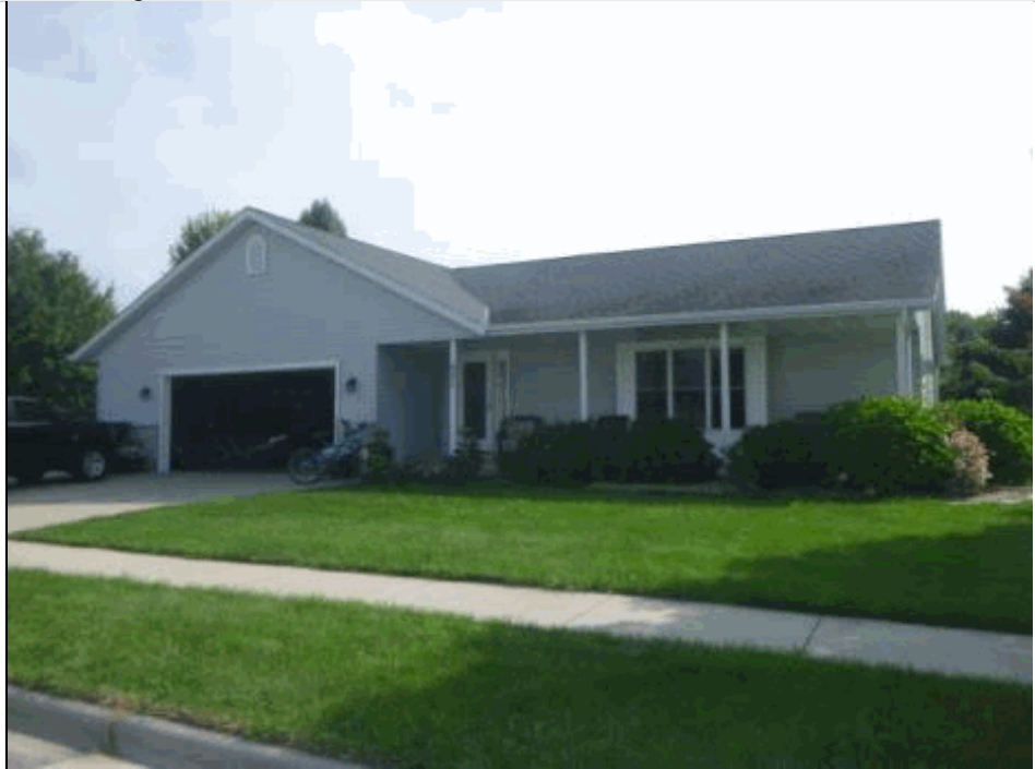
Total living area is 2,382 SF; building assessed value is $351,700