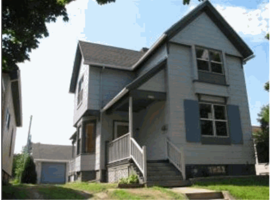
Total living area is 1,812 SF; building assessed value is $137,000