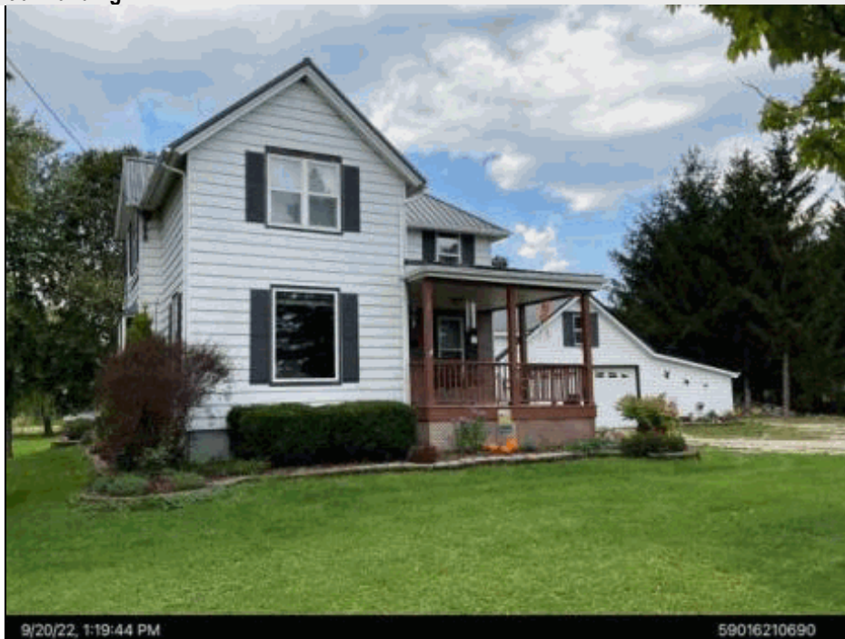
Total living area is 2,302 SF; building assessed value is $133,000