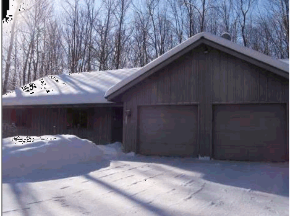
Total living area is 2,526 SF; building assessed value is $193,300