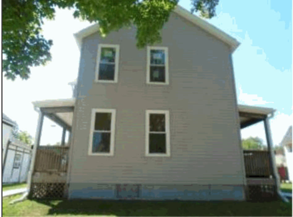
Total living area is 1,840 SF; building assessed value is $104,300