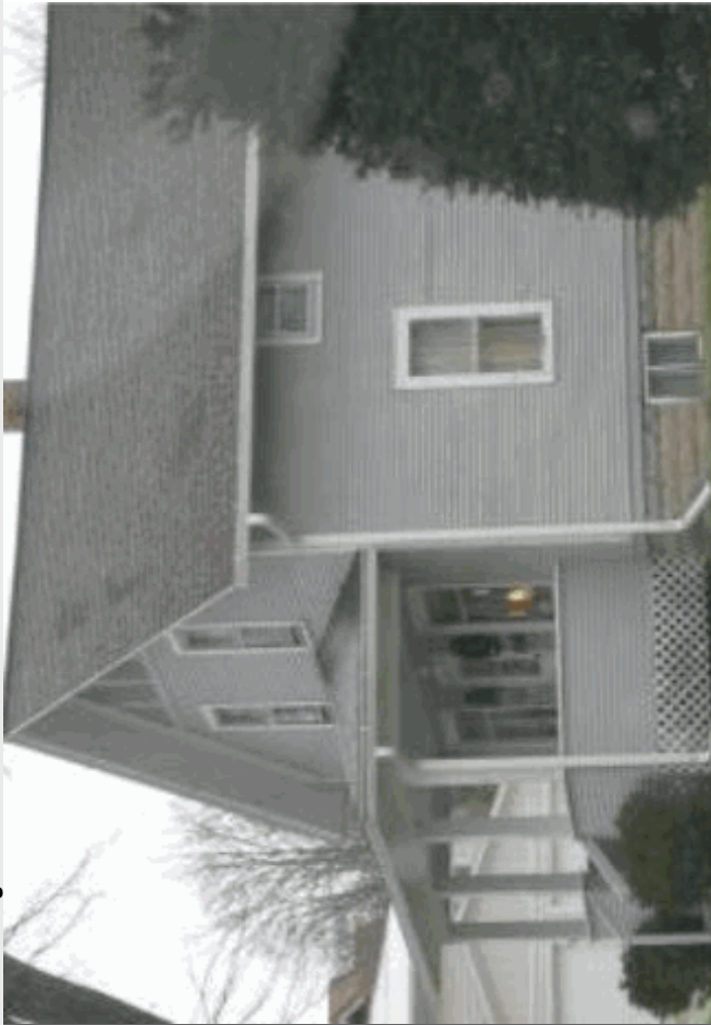
Total living area is 1,260 SF; building assessed value is $61,100