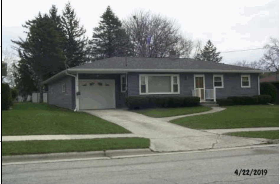
Total living area is 1,120 SF; building assessed value is $161,200