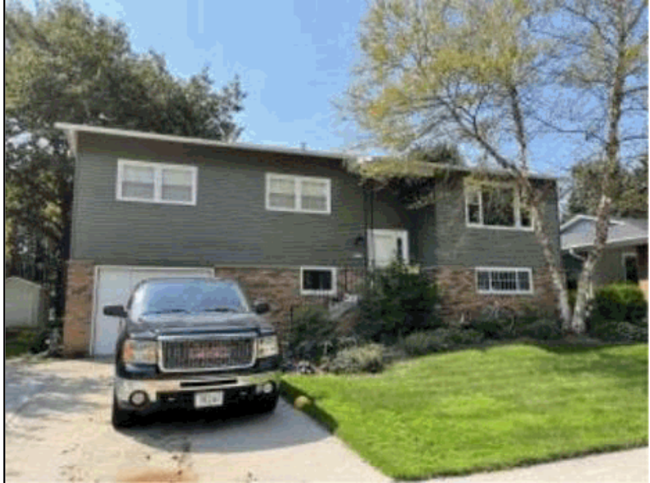
Total living area is 1,944 SF; building assessed value is $253,400