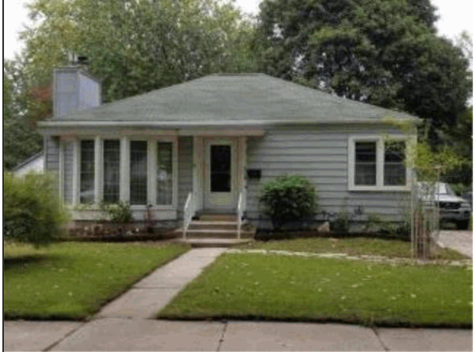
Total living area is 1,146 SF; building assessed value is $136,400