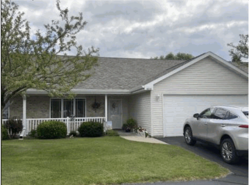
Total living area is 1,469 SF; building assessed value is $245,400