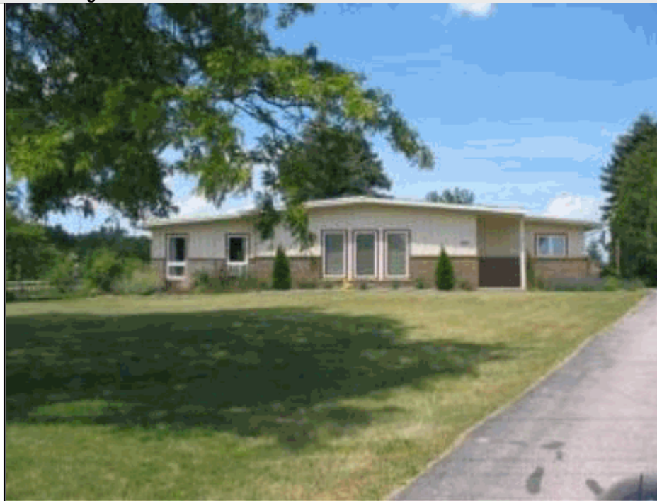
Total living area is 2,043 SF; building assessed value is $313,600