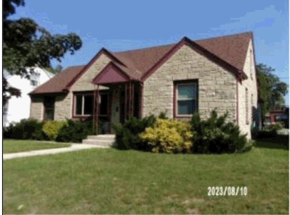
Total living area is 1,370 SF; building assessed value is $195,700