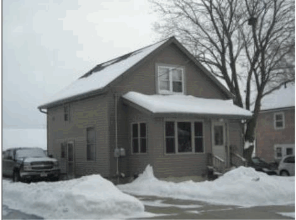
Total living area is 792 SF; building assessed value is $43,800