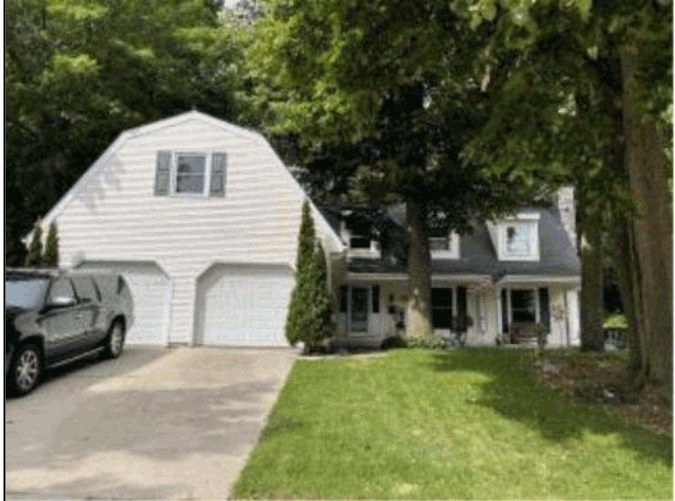
Total living area is 2,304 SF; building assessed value is $402,600