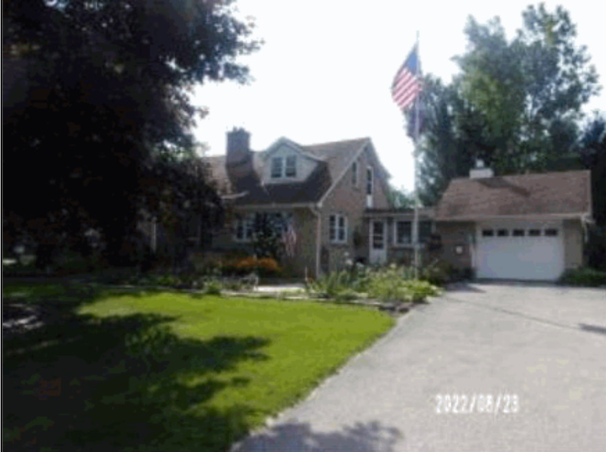
Total living area is 2,026 SF; building assessed value is $209,300