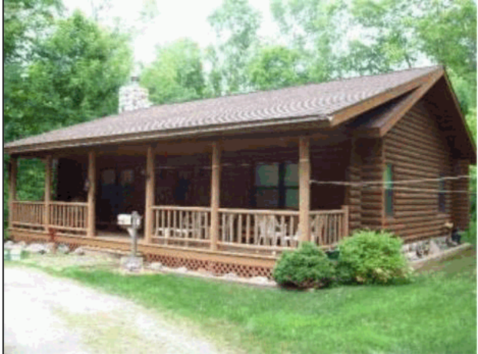
Total living area is 1,064 SF; building assessed value is $133,700