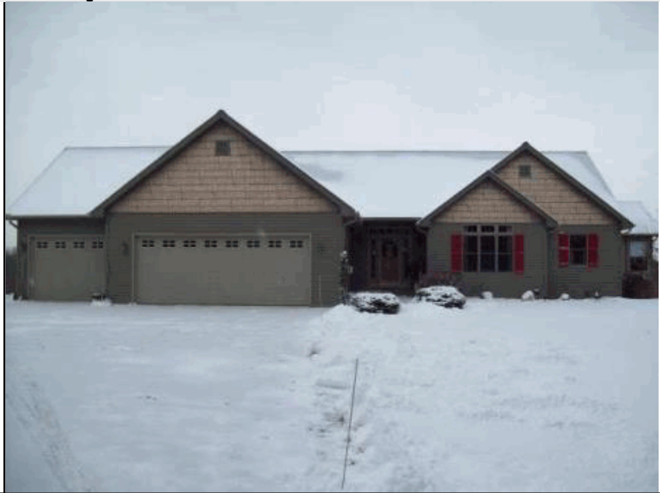
Total living area is 3,052 SF; building assessed value is $264,500