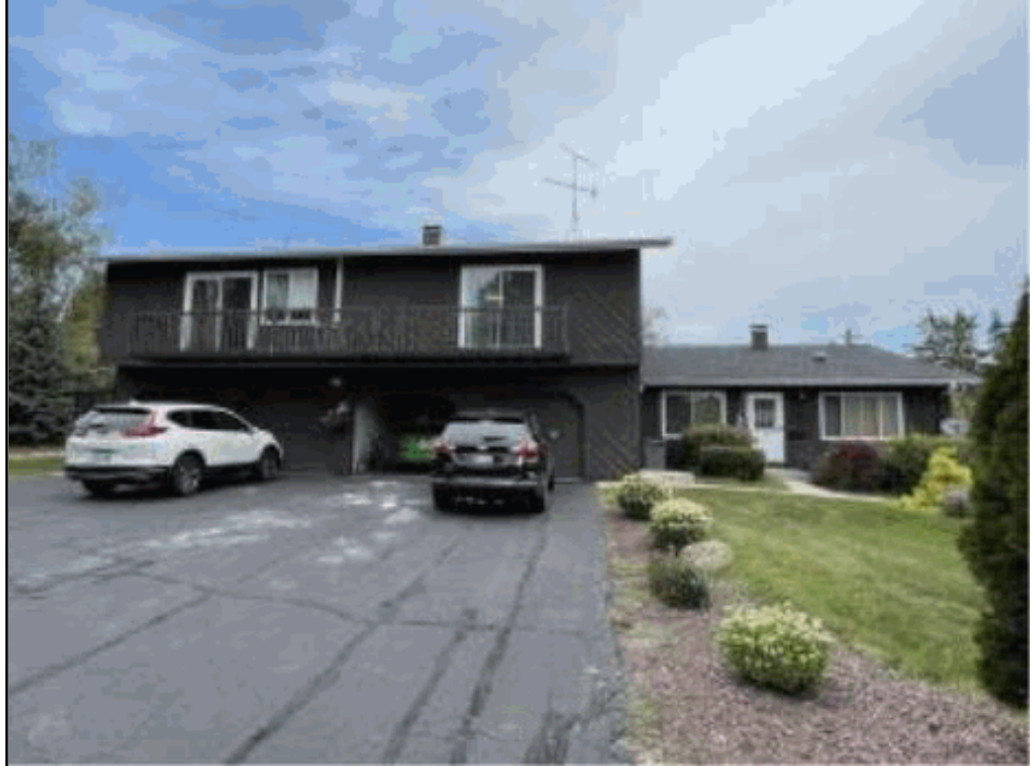
Total living area is 1,020 SF; building assessed value is $110,800