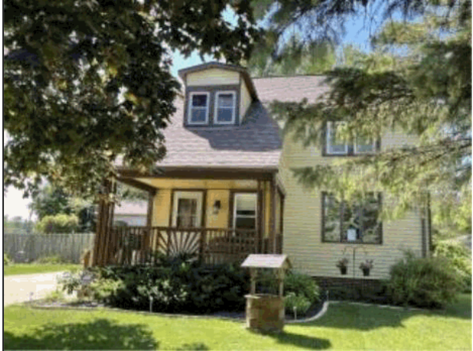
Total living area is 1,780 SF; building assessed value is $161,700