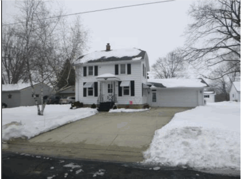
Total living area is 1,344 SF; building assessed value is $77,400