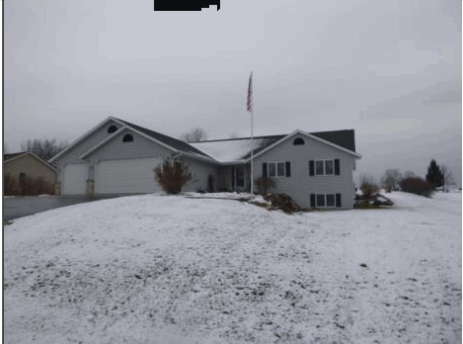
Total living area is 2,598 SF; building assessed value is $217,200