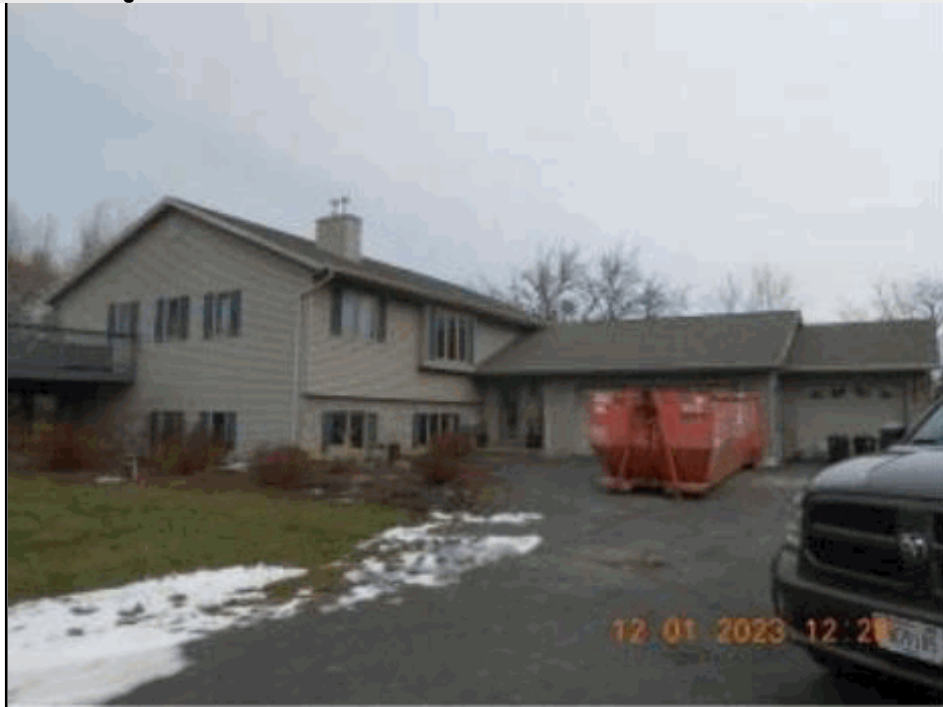
Total living area is 3,432 SF; building assessed value is $245,400