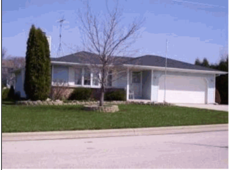
Total living area is 1,174 SF; building assessed value is $226,200